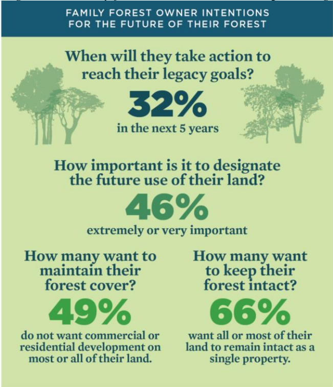
Figure 2. Family forest owner interest in planning for the future of their land.